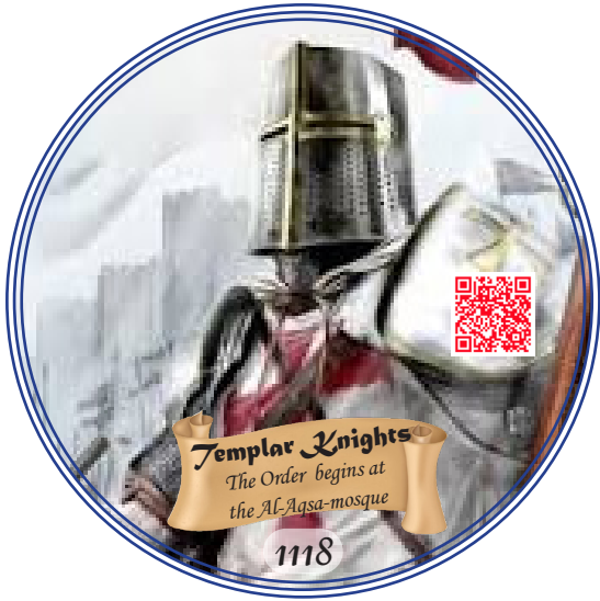
Templar Knights The Order begins at the Al-Aqsa-mosque