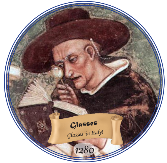
Glasses Glasses in Italy!