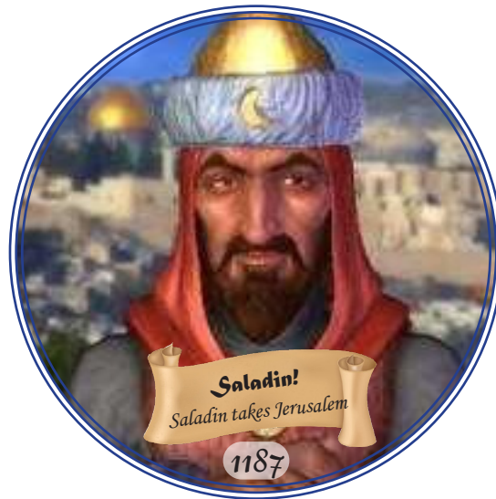
Saladin! Saladin takes Jerusalem