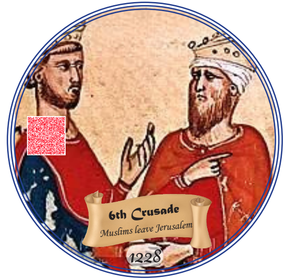
6th Crusade Muslims leave Jerusalem