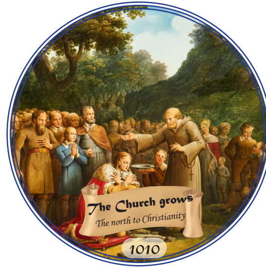
The Church grows The north to Christianity