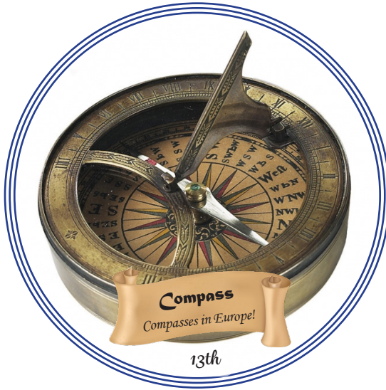
Compass Compasses in Europe!