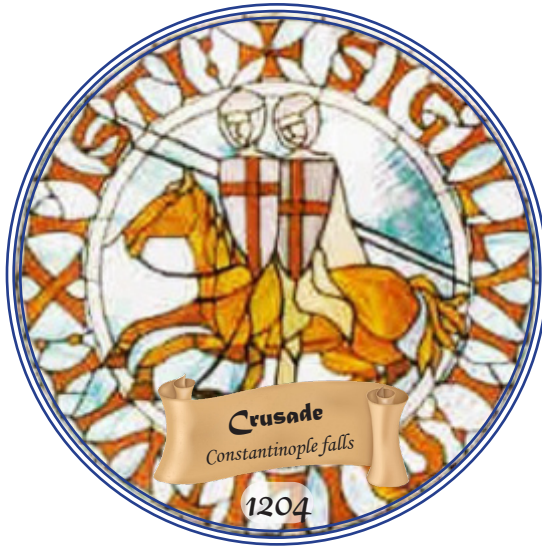
Crusade Constantinople falls