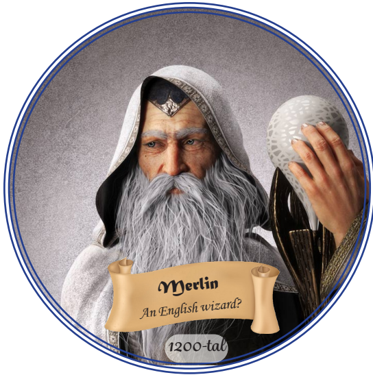
Merlin An English wizard?