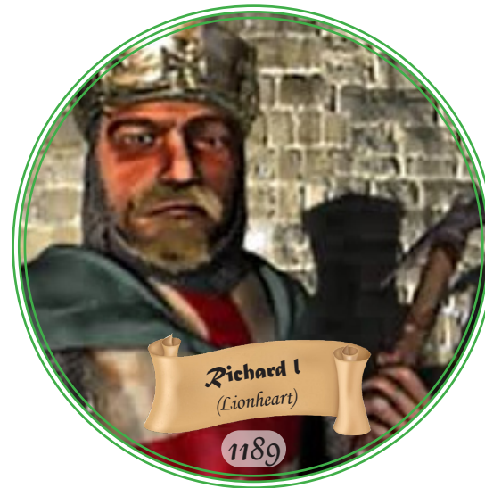
Richard I (Lionheart)