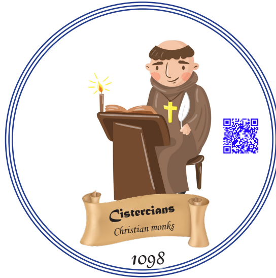
Cistercians Christian monks