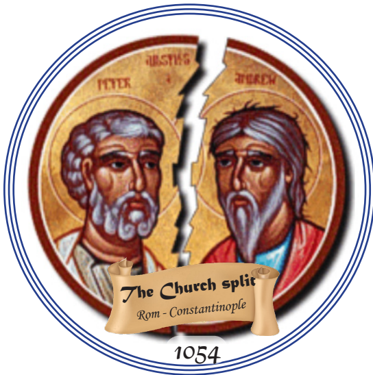
The Church split Rom - Constantinople