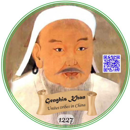
Genghis Khan Unites tribes in China